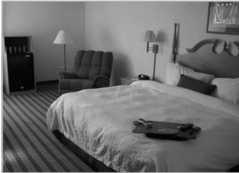
The OGH Sleep Disorder Center at the Hampton Inn in Olean provides the most comfortable, home-like atmosphere to evaluate patient sleep disorders.

In our country alone, an estimated 40 million Americans suffer from sleep disorders ranging from insomnia to sleep apnea. Sadly, a large percentage of these sleep disorders go undiagnosed and untreated, resulting in restless sleep, diminished energy and/or a decline in overall health and wellness. The first step to better sleep is simply recognizing the problem.